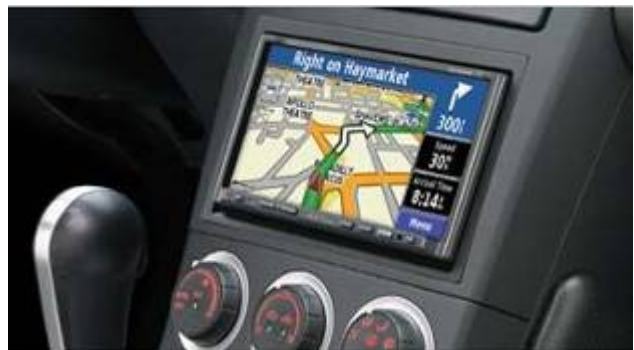
Figure 5: Integrated navigation system using audio interface

In conclusion, tantalum and OxiCap capacitors are well suited to any modern automotive electronic system, whether the requirements are for enhanced reliability, wider temperature range or low leakage current.