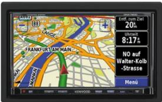
Figure 4: Front panel of car navigation system

Series NOJ OxiCaps have a very high reliability level (failure rate 0.5%/1000 hours); low ESR NOS devices have an even lower failure rate (0.2%/1000 hours) - even more reliable than tantalum capacitors. They are suitable for applications with rail voltages of up to 8V, such as in-cabin entertainment systems, seat position modules, airbag controls etc. More, OxiCap devices offer noise-free performance and exhibit very good stability over temperature, which is preferred for absolute sound quality and a big advantage for car audio devices (Fig. 4, Fig. 5).