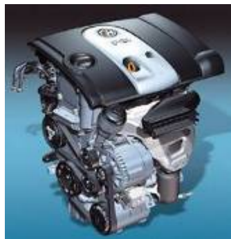
Figure 2: Car gasoline engine unit

Standard tantalum capacitors technologies typically have a temperature range of -55 to +125\text{degC} which restricts their usage to cabin entertainment and other lower temperature applications only. Some producers specifically market automotive families, which expand the possible usage of tantalum capacitors to engine compartment systems (Fig. 2, Fig. 3) which demand a continuous operating temperature of up to 150\text{degC} . However, the automotive industry requires components that work up to 175\text{degC} . With an operating temperature range of -55 to +175\text{degC} , AVX's THJ series meets this requirement. The category voltage, which is the maximum working voltage when actual operating temperature is considered, is 50% of rated voltage at 175\text{degC} . THJ series tantalum capacitors also offer enhanced reliability (failure rate 0.5%/1000 hours) and a higher category voltage at 125\text{ degC} (78% of rated voltage) than standard devices have (typically only 66 % of V_r ). THJ capacitors are available up to 150\mu\text{F} and rated at up to 50V.