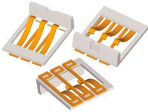
Figure 4. The simple design of ultralow-profile connectors can reduce z-axis height by 50%, or as low as 2.0 mm.

The first connector to be released in the new ultralow-profile family starts with a contact beam static height of 2.45 mm. Once fully deflected, the compressed height reduces to 1.3 mm above the board, or about a 50% reduction in z-axis height from the battery connectors discussed previously. Remarkably, even at this profile, the primary and secondary performance features of the connector have not been sacrificed. This is still a 3-A contact system providing high durability and high-tolerance absorption features that are derived from proven beryllium-copper base material and a stable contact beam design. The long sweeping design of this contact provides positive mechanical solder attachment to the PCB with a full-length tail that extends from both ends of the insulator. The high-temperature insulator has an integral end stop to aid in either radial (angular) or slide-in (horizontal) battery engagement.